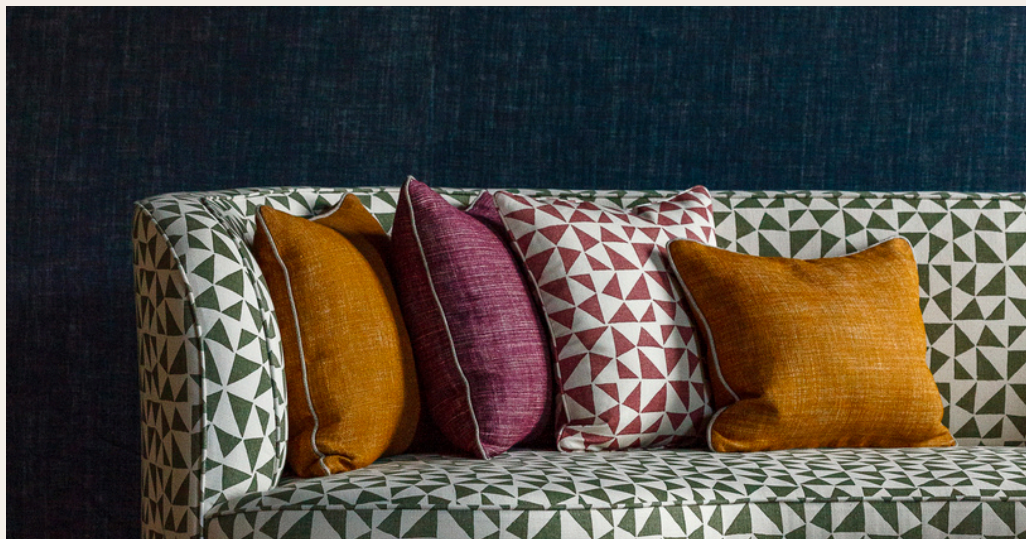
UKFT member: Fermoie