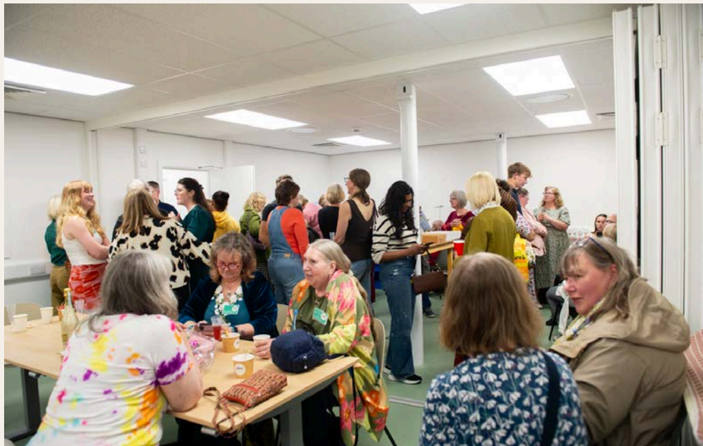
UKFT member: Creation Mill

UKFT membership offers opportunities to showcase your business, get involved in UKFT campaigns and activity, shape debates and influence key issues for the industry.