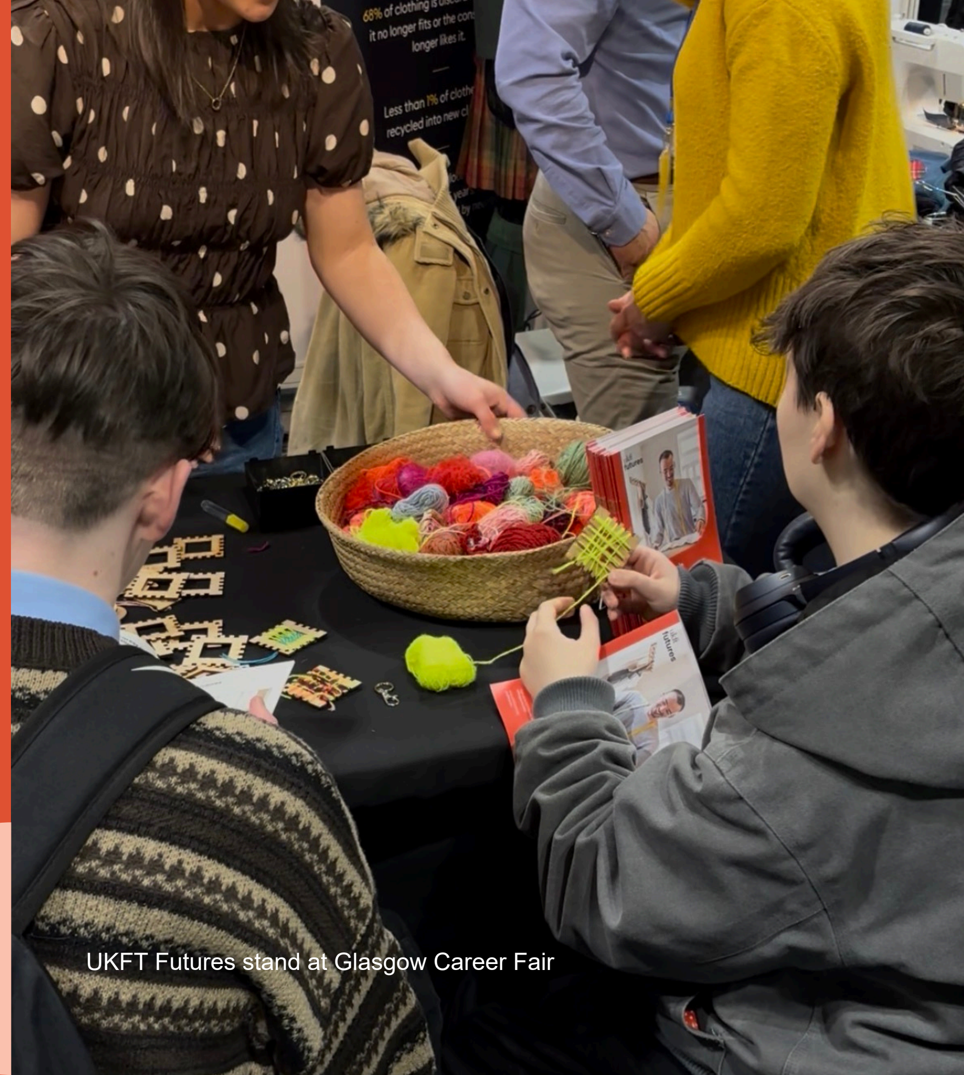
UKFT Futures stand at Glasgow Career Fair