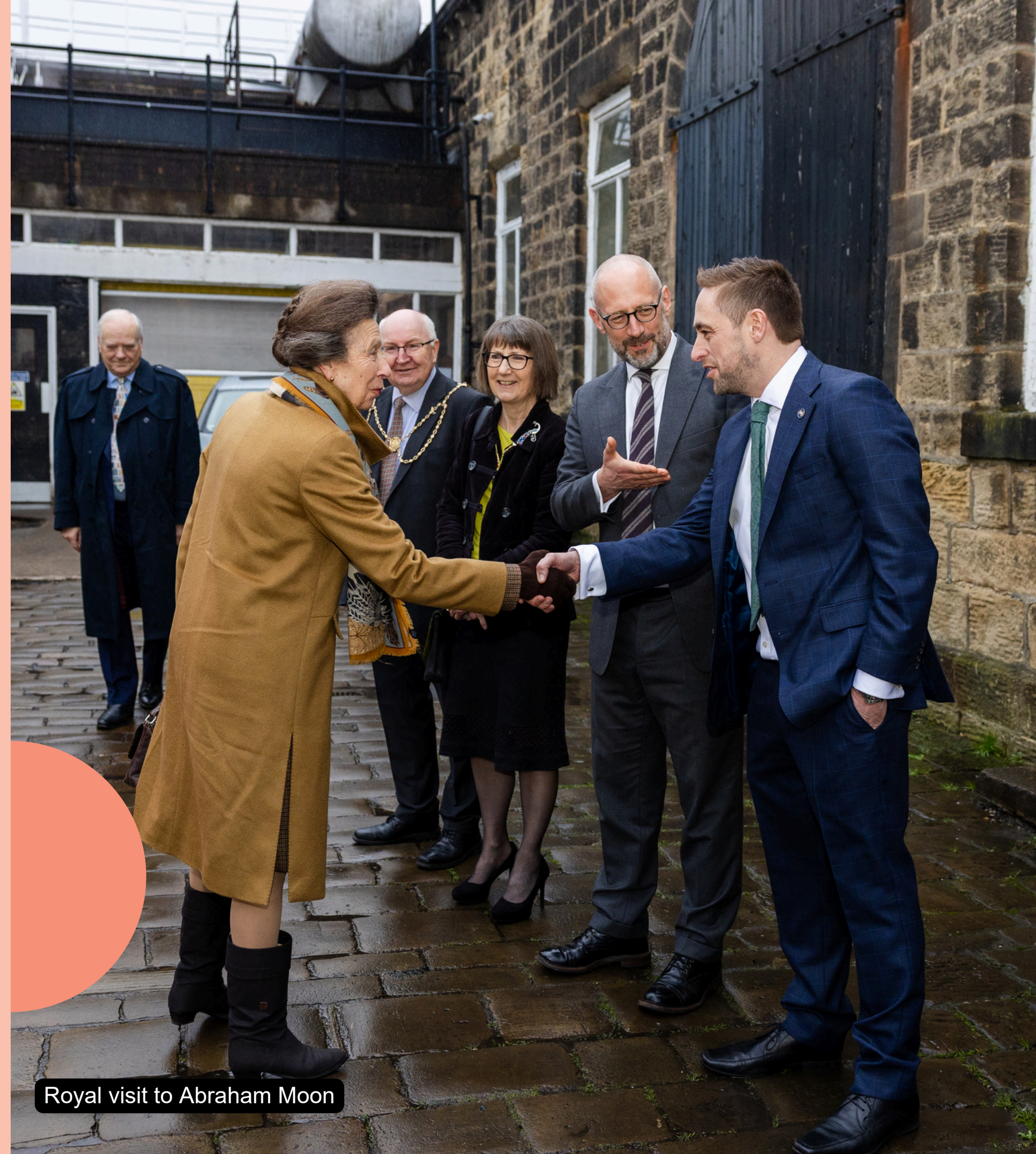
Royal visit to Abraham Moon