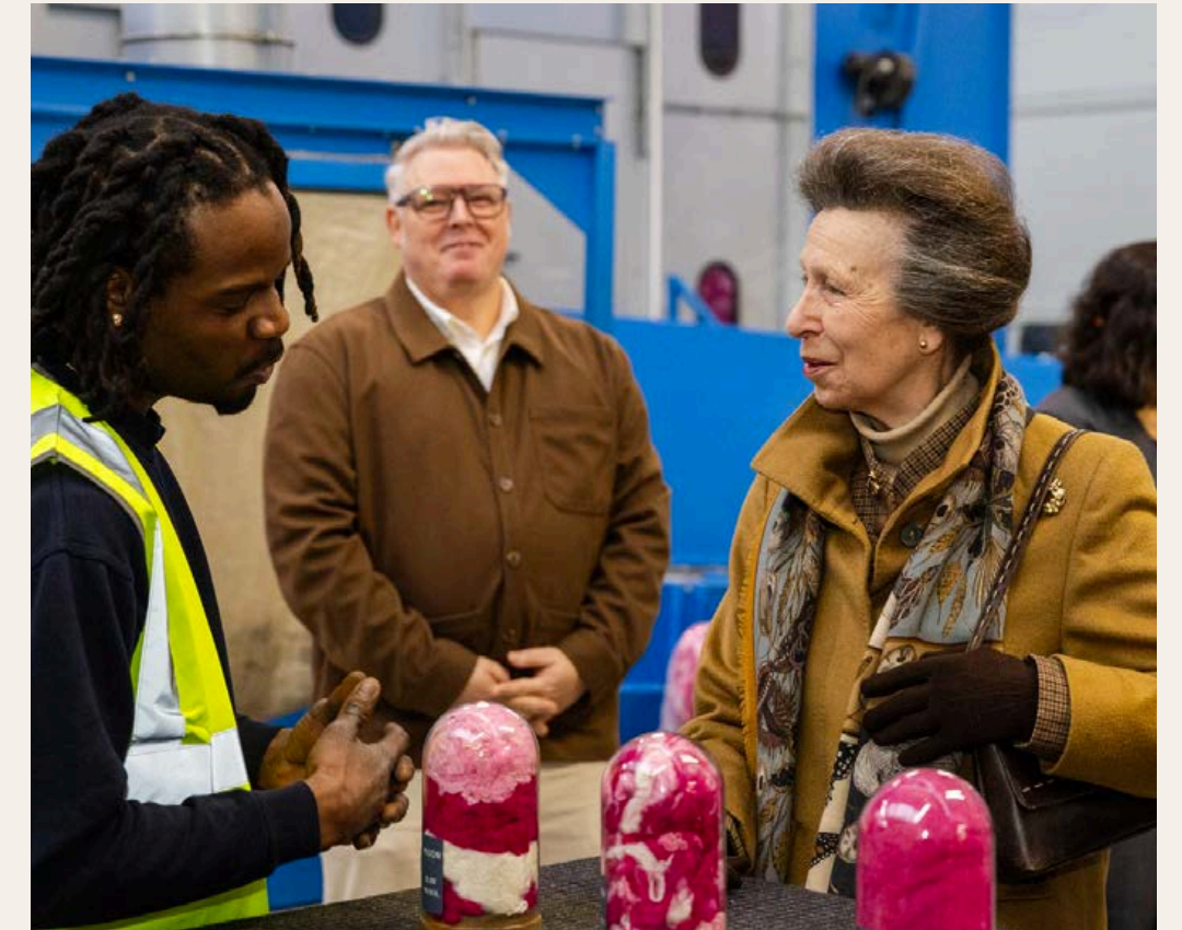
UKFT Royal visit to Abraham Moon