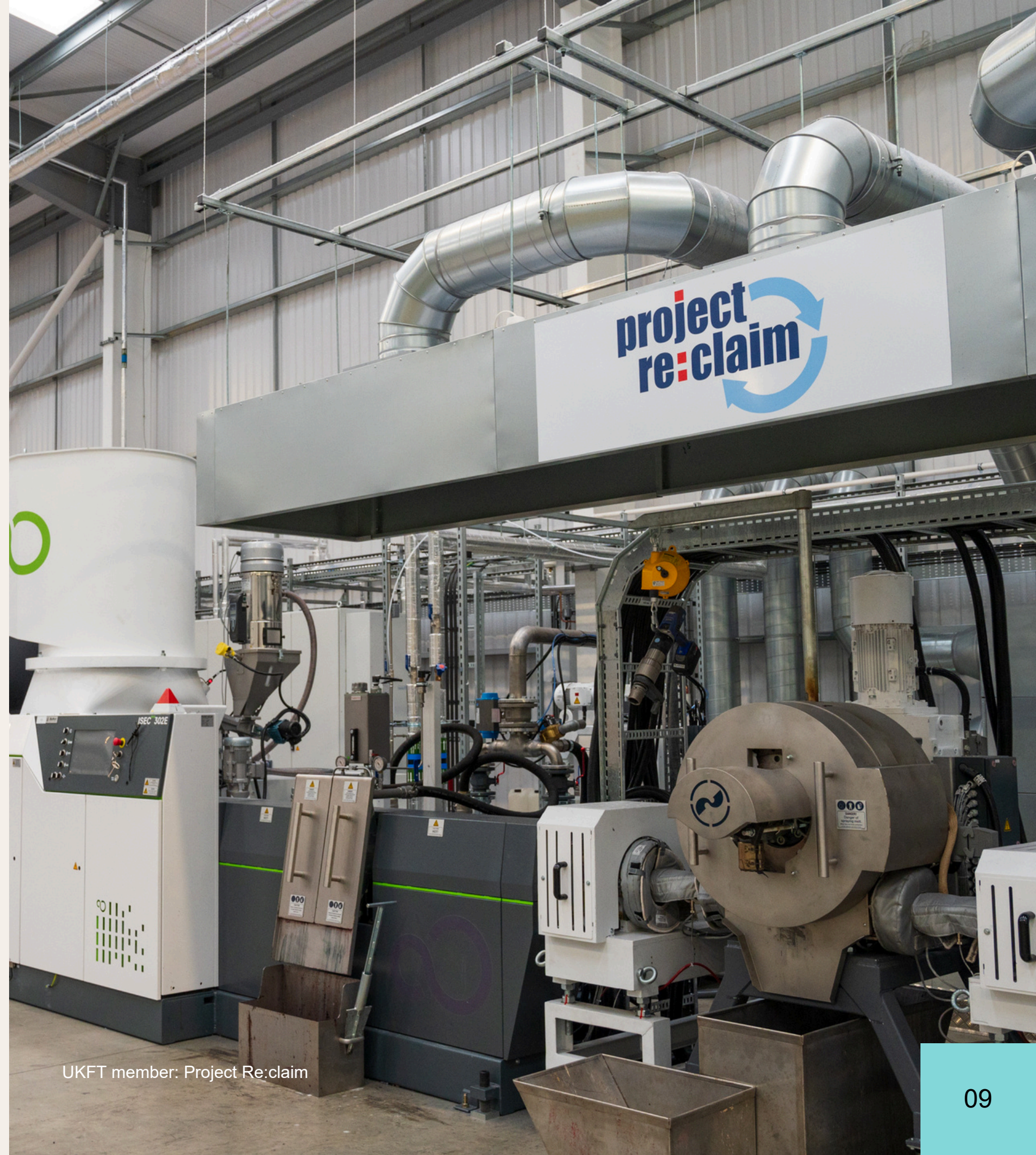
UKFT member: Project Re:claim