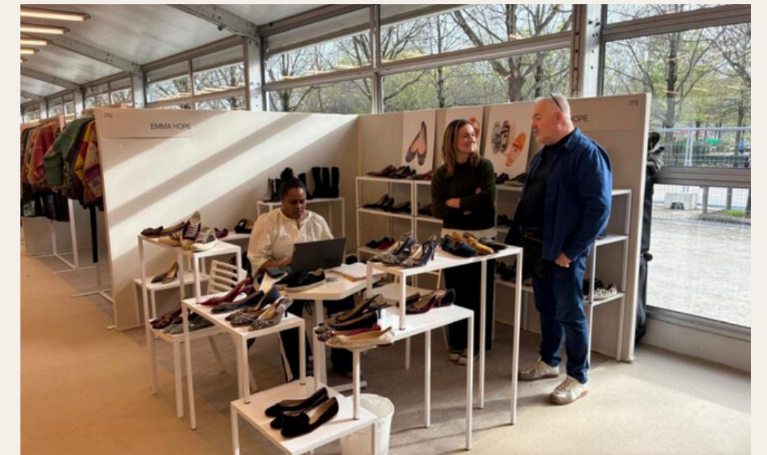
Paris Women's Fashion Week (March 2026)