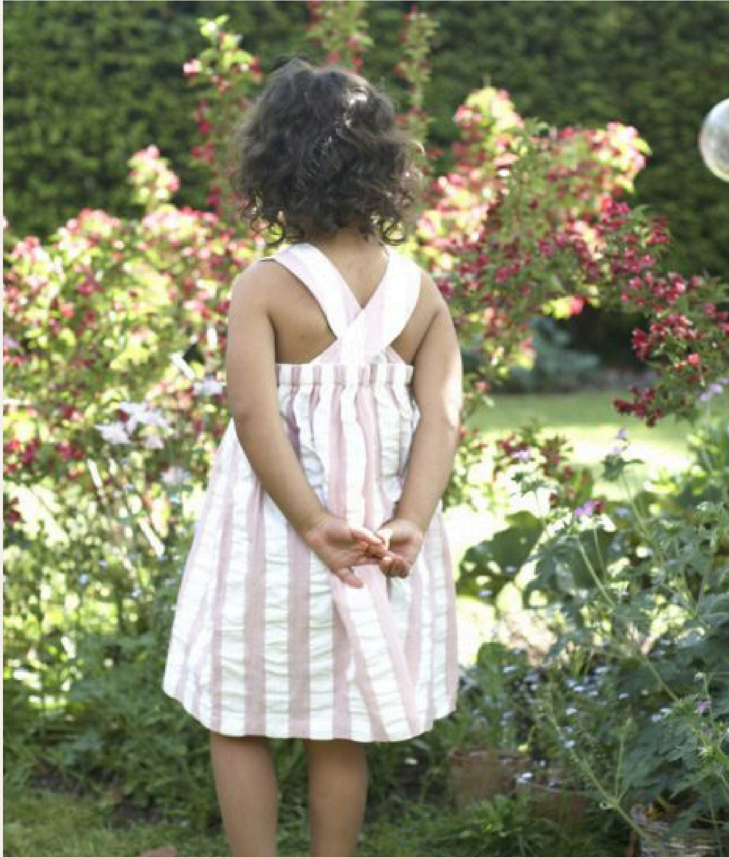
UKFT member: Pigeon Organics