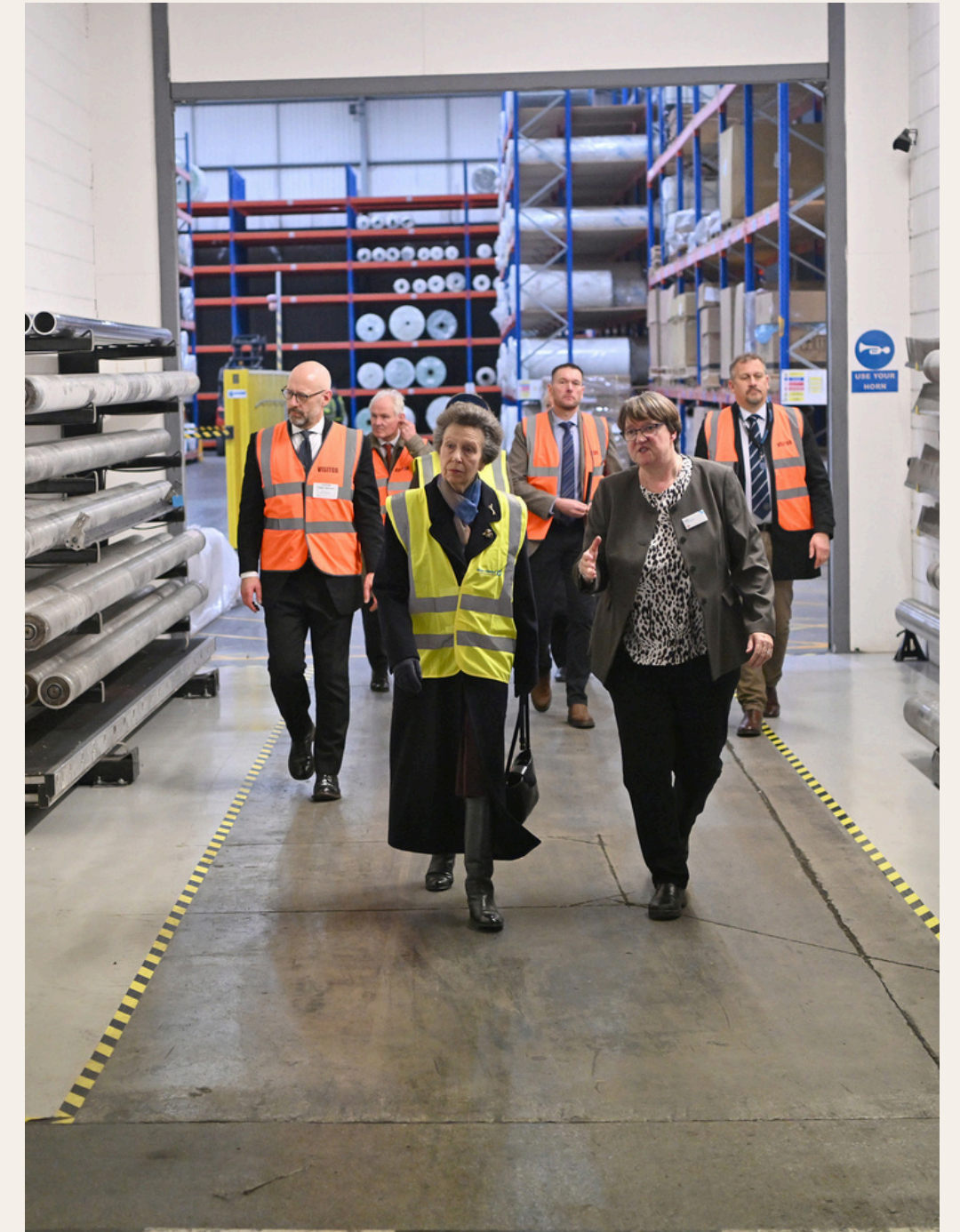
Royal visit to James Dewhurst Limited

We continue to have a very close relationship with Euratex, the European Apparel and Textile Federation, and also maintain a relationship directly with the European Commission. The EU Delegated Act that will set out the parameters of the EU's DPP is due to be published in the coming months, and we expect the implementation phase for DPP will be extended from 18 month to 24 months as a direct result of UKFT's lobbying.